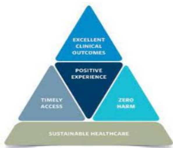
Figure 2: Duties of Obstetric Nurses [11]

The nurses, who are included in Obstetrical (OB) nursing help in providing the testing and parental care, care at the time of delivery and labor and the care of several patients that are experiencing the complications of pregnancy. The obstetrical nurses are working closely with nurse practitioners, midwives and obstetricians [7]. The obstetrical nurses are the most unique nursing professionals that are responsible for welcoming new babies into this world. Furthermore, they also care for the overall family at the time of childbirth and also they are instrumental figures within the lives of both babies and parents both. The OB nurses are taking several day-to-day responsibilities and they might walk through several birthing processes with moms that are going to deliver. Hence, it also helps the parents in adjusting to the latest and new roles after the delivery process.