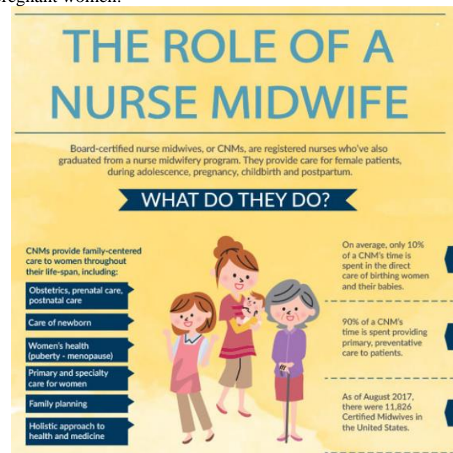
Figure 1: Roles of Midwifery nurses [8]

Furthermore, the nurses act as a Leader and the main role of the leader is to review, provide and plan about the care of women with their agreement and input. It is done to the period of postnatal from the antenatal assessment in an initial stage. The leading role of the Midwife reduces the admission process to any hospital and also results in less intervention during the time of birth [8]. Fourthly, they also act as a good Communicator as the midwives always understand the overall effectiveness of the communication process. However, it also helps in developing a trusting relationship with the family members and pregnant women. The midwife also has to communicate in an effective manner with family